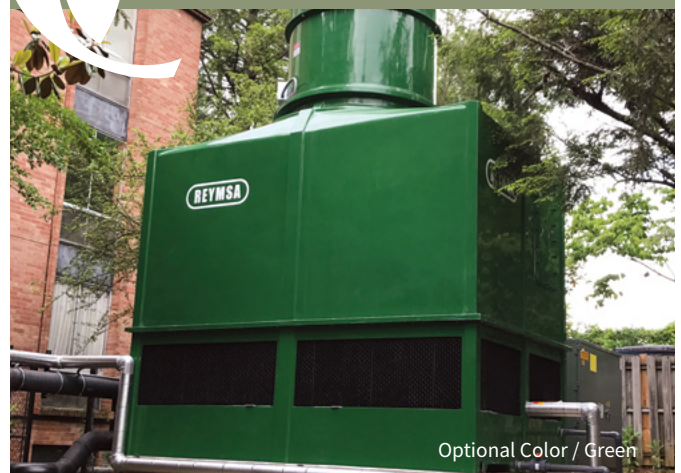
Optional Color / Green

It's not enough to be eco-friendly , you have to show it!