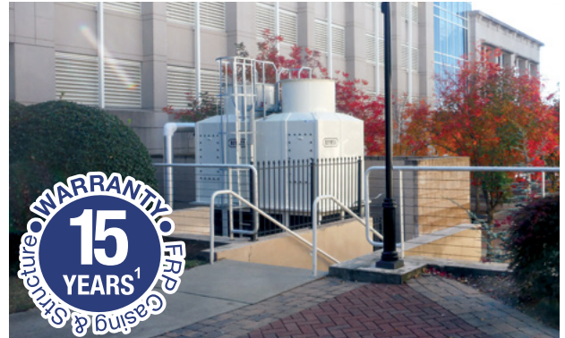
An eye-catching appearance results in public and workspace coming together.